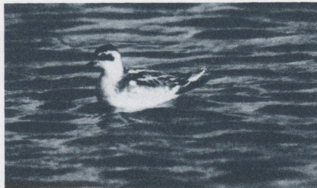
Red-necked Phalarope, Green Lane Res., 10/12/88.

A Red-necked Phalarope was at GLR 10/12 (RW.ph.); at one point it swam to within 3 ft of the observer. Two Bonaparte's Gull were there 12/11 (NT). W&NM were surprised to see a Great Black-backed Gull at FWSP 11/6 in view of the absence of water there. A Common Barn-Owl was seen in the Red Hill area 12/7 (GAF), and the Barred Owl at VFNP, reported in March as a 1st record for the park, obliged the CBC 12/31 (RG). Chimney Swift were still being seen in the area as late as 10/19 (DT). A Pileated Woodpecker was found in the upper UCV 12/18 (GLF), where 4 pair bred this summer (WNM).